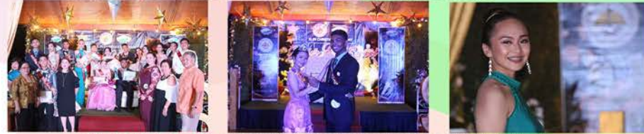
MARCH 4, 2017 JS PROM - EUGENIO CABEZAS HIGH SCHOOL