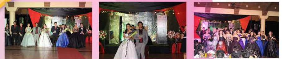
FEBRUARY 25, 2017 JS PROM - ST. NIÑO DE PRAGA ACADEMY OF LA PAZ