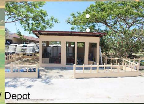
Gas Farm / Depot