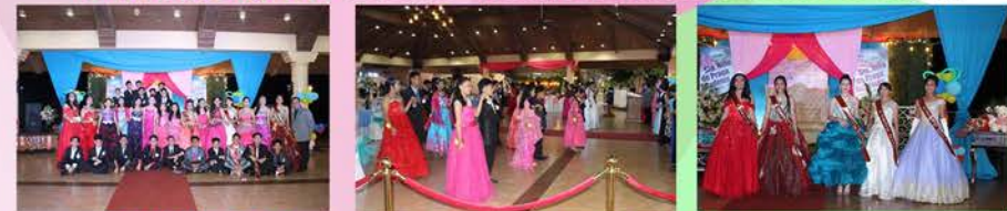
MARCH 3, 2017 HS NIGHT - ELIM CHRISTIAN ACADEMY