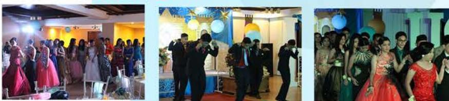
FEBRUARY 24, 2017 JS PROM - COLEGIO DE NAIC