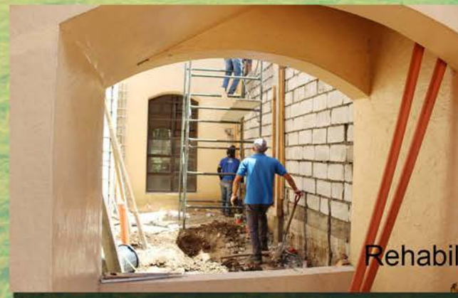
Rehabilitation of Restrooms