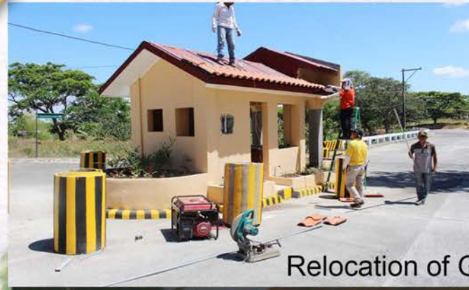
Relocation of Guard House

On going construction of the following projects: